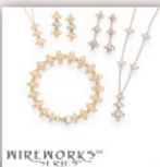
WIREWORKS™ BY RITANI