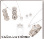
Endless Love Collection